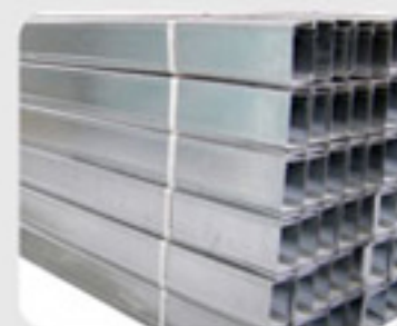
Light steel keel